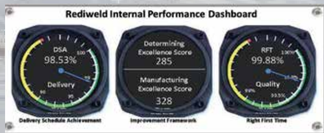
Rediweld Internal Performance Dashboard