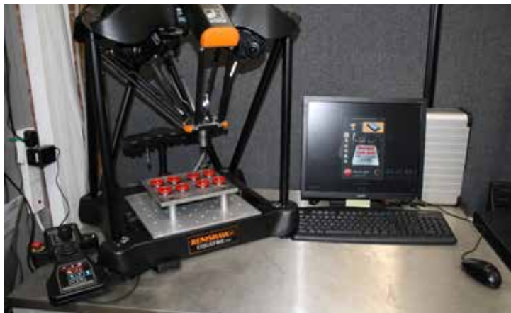
Equator Gauging System

To address these two separate issues we worked closely with Renishaw which resulted in us purchasing an Aberlink Computer Numerically Controlled (CNC) Coordinate Measuring Machine (CMM) and an Equator gauging system which is a reprogrammable comparator providing shop floor gauging that is highly repeatable, thermally insensitive, versatile and fast.